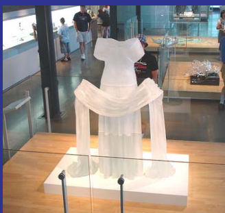
A Dress Made of Glass!