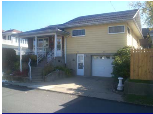
A beautiful home from the front (above) And a view of the back yard and patio area (below right)

Renovations on the home included restoration of original hard wood flooring that had been covered by carpet and other cosmetic improvements around the house.