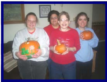
Ladies at Clover Apt Present Their Pumpkins!